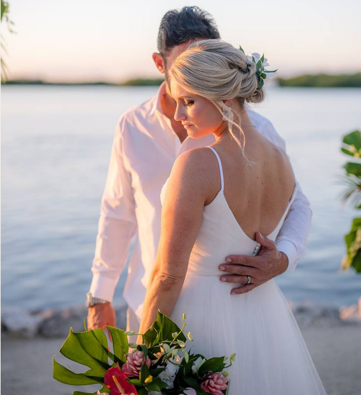
Lisa & Greg Poland Photography